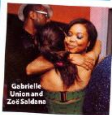
Gabrielle Union and Zoë Saldana